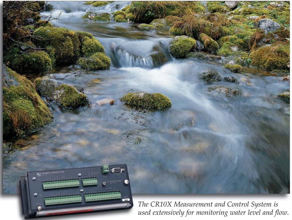
The CR10X Measurement and Control System is used extensively for monitoring water level and flow.

Campbell Scientific's systems for unattended, long-term monitoring of flow and level provide unmatched versatility and reliability. Our systems measure flow and level in many environments including wells, dams, streams, weirs, stormwater systems, and water/wastewater treatment plants. Reliability is not compromised by salinity level, pollution levels, or other harsh environments. Key components of our systems are dataloggers, sensors, and communications devices, which can be customized for each site.