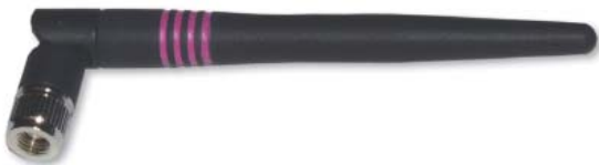
The 16005 antenna has an articulating knuckle joint that can be oriented vertically or at right angles.