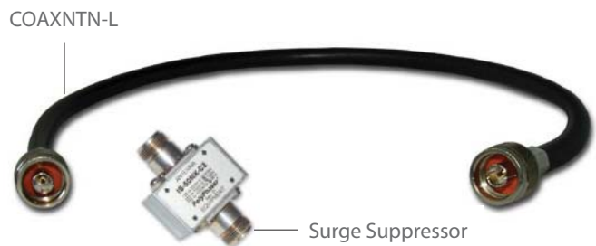
Radio installations that are susceptible to lightning should use a COAXNTN cable and a 14462 or 16982 surge protector kit.

The RF401-series and RF430-series radios are compatible with the retired RF400-series radios if the RF401-series or RF430-series radios use the Transparent protocol setting. Campbell Scientific does not recommend using RF401-series or RF430-series radios in networks containing RF450 Spread Spectrum Radios.