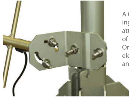
A CM230 supporting a Yagi antenna is attached to the mast of a CM110 tripod. Only the first cross-element of the Yagi antenna is shown.