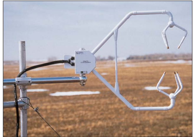
The CSAT3, shown making measurements over a fallow field in Minnesota, provides precision turbulence measurements with minimal flow distortion.

The SDM protocol supports a group trigger for synchronizing multiple CSAT3s. The FW05 fine wire thermocouple (12.7 \mu\text{m} diameter) is available as an option for fast response temperature measurements.