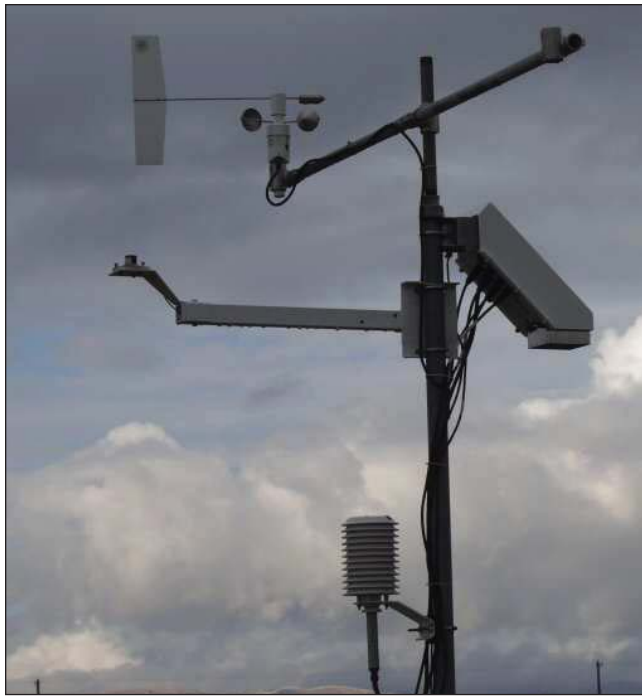
The CS110's internal datalogger can measure additional meteorological sensors—making the CS110 the center of a full weather station.