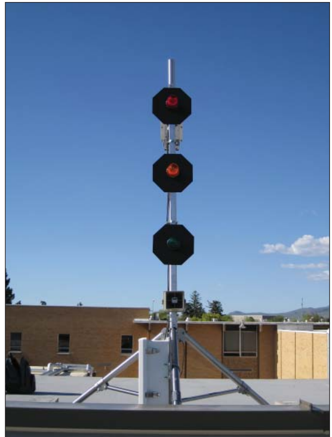
Logan High School in Logan Utah has installed a lightning warning system that includes the CS110. The CS110 is mounted to a CM110 10-ft stainless-steel tripod that sits on a roof next to the football field (left). Lights included in the system indicate the likelihood of lightning (right).