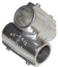
▶ The 17953 NU-RAIL® Crossover Fitting connects a vertical 1.0-inch IPS pipe to a horizontal 1.0-inch IPS pipe.

The 034B can be attached to a CM202, CM204, or CM206 crossarm via a 17953 NU-RAIL fitting or a CM220 Right Angle Mounting Bracket. Alternatively, the 034B can be attached to the top of our stainless-steel tripods via the CM216 Sensor Mounting Kit. The CM216 extends 4 inches above the mast of a stainless steel CM110, CM115, or CM120 tripod.