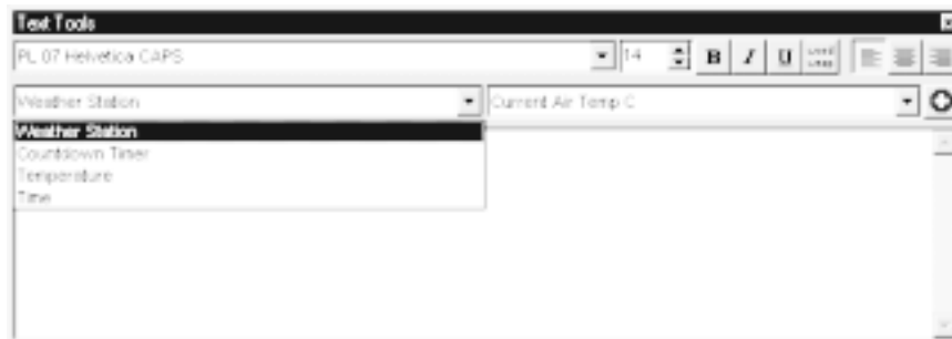
FIGURE 2. The available options provided by the source menu are shown.