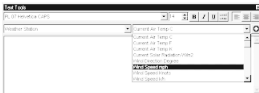
FIGURE 3. When the weather station source has been chosen, several meteorological conditions reported in various units are provided under the field menu.

The RDE takes the data from the selected location in the cache memory, and puts it in the corresponding RDE slot. The slot in the RDE has a field name that will appear in the message editor's Field Pull-Down menu (see Figures 1 and 3).